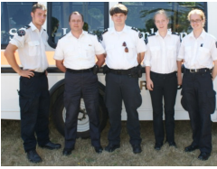
2009 SRI Chimnoy Triathlon