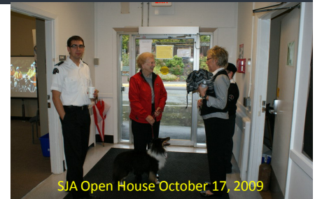
SJA Open House October 17, 2009